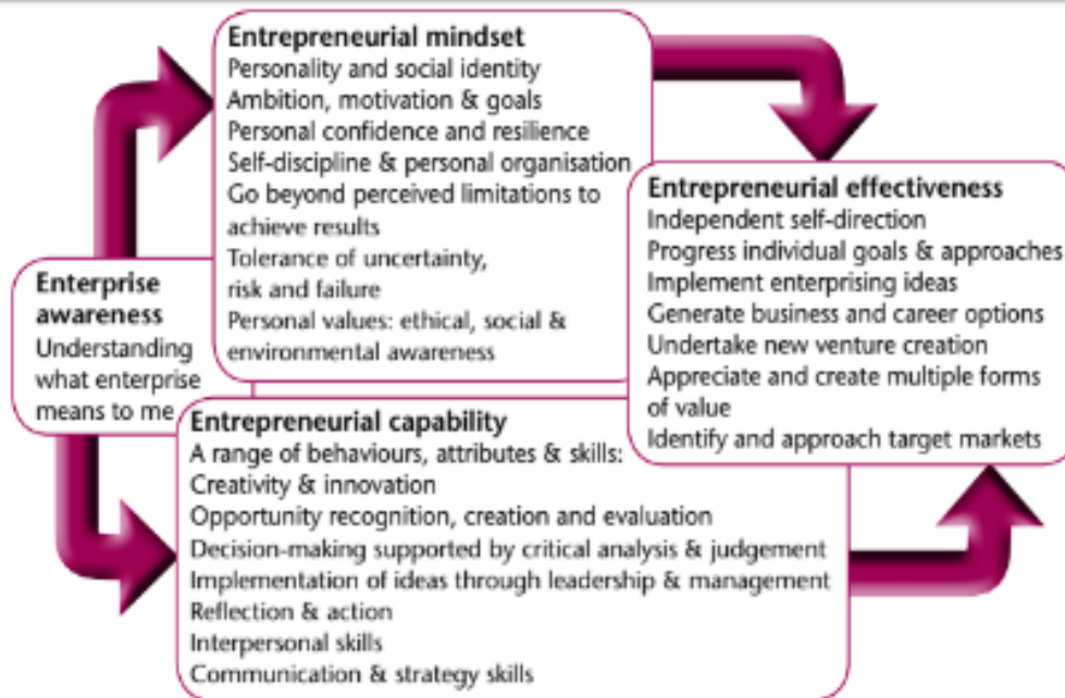
Figure 3. Developing entrepreneurial effectiveness model from “Enterprise and Entrepreneurial Education” on page 12, from QQA (Figure 1.; 2012)