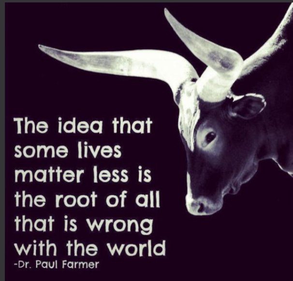
Figure 1. Quote from Paul Farmer A