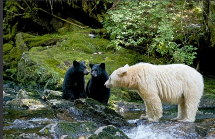
Figure 2. Two black bear cubs and an albino (spirit) bear B