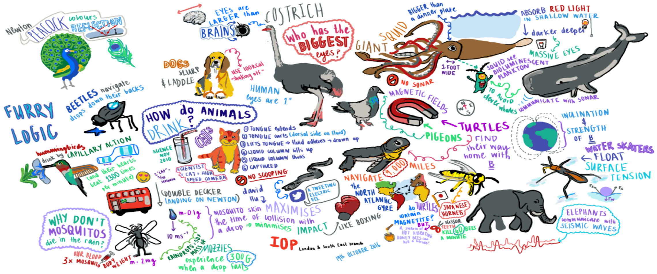
Figure 4. Curiosity and inquiry depiction of aquatic and terrestrial fauna D

Inquiry Question: There are over 1.3 million idiosyncratic species of animals on Earth; how can we comprehensively learn more about their epistemological phenomena?